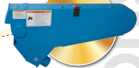
Standard Belt Head Guard