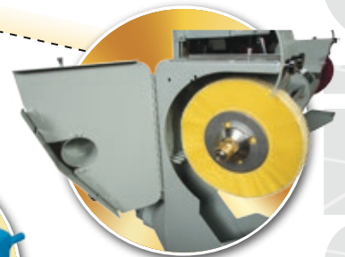
Buff/Wheel Guard - Open Position