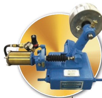
6A - Backstand

The Buffing Lathe comes stock - as shown below. There is a wide array of add-on equipment available to customize your lathe to your particular application, such as; Belt Head Guards, Buff Wheel Guards or Back Stands. All of these can be integrated with other Hammond Machines to perform the task you are looking to accomplish. Talk to one of our representatives to customize your machine.