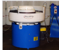
Vibratory Bowl Gemini Series: For applications using plastic, ceramic and other non-metallic media.