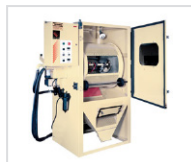
Air Blast Cabinet: Automate cleaning, peening and finishing of small workpieces. With certain types of parts, these machines deliver consistent finishing—automatically.