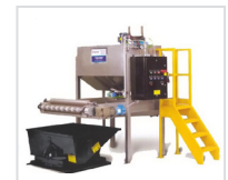
Wastewater Treatment Systems: Optimizes the use of clay based flocculants to clarify industrial wastewaters.