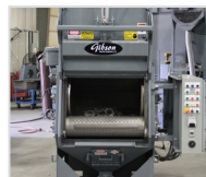
Tumble Blasters: Airless shot blasting complete with air wash systems.