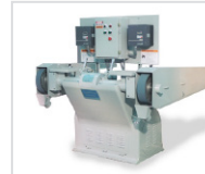
Polishing and Buffing Lathe: The most dependable polishing Lathe in the industry of this type.