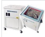
Tub Burr Bench: An economical, portable deburring machine used for a wide variety of metal finishing applications.