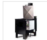
Parts Washer: Standard and custom cleaning systems, including cabinet, drum, rotary basket, and ultrasonic cleaners.