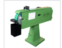
K3000 Belt Grinding Machine: Abrasive belt & brush grinding equipment, heavy-duty, built-to-last product. Wide variety of configurations are available.