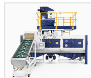
THM Blasters: Allows processing both bulk material and complex, sensitive individual parts. Available in a range of configurations, adjusted to your needs and size of your workpiece.